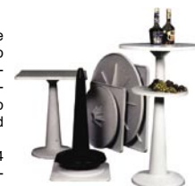
Table tops are white only and available with or without the umbrella hole (without hole is standard). All of our Bistro Table have a stacking conical leg system , for easy storage. Assembly/disassembly is easy, no tool required. Røvergarden tables are resin products guaranteed resistant to all weather conditions and UV rays. They are easily cleaned using water and a neutral liquid detergent. To insure better stability, wide single leg tables have an 81/4 lbs ballast. The conical leg system is also available for customized table tops, ask for details.

24" square white top #1033 black leg #1133 white leg 27" square white top #1039 black leg #1139 white leg 31" square white top #1032 black leg #1132 white leg